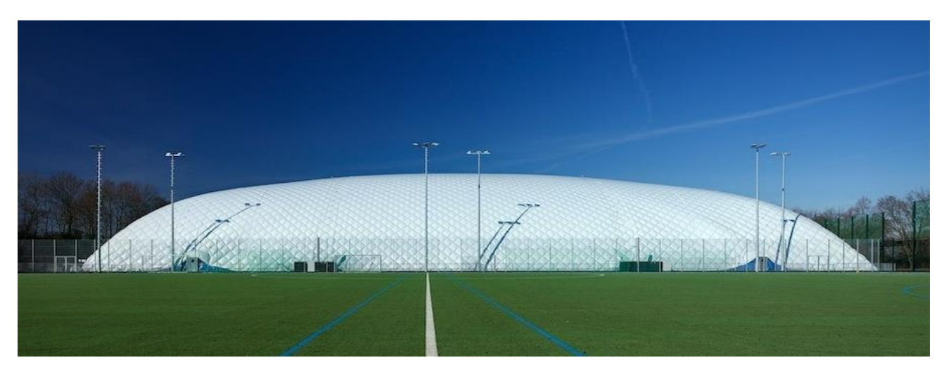
Hockey hall 6,400 sqm - "supported and heated" by 2 units type K300/D (total air output 48,000 cbm/h)

Individually matching to project requirements and customers reguests.