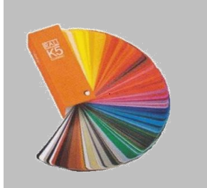
Varnish possible in any RAL colour

Illustration partly with configuration possibilities.