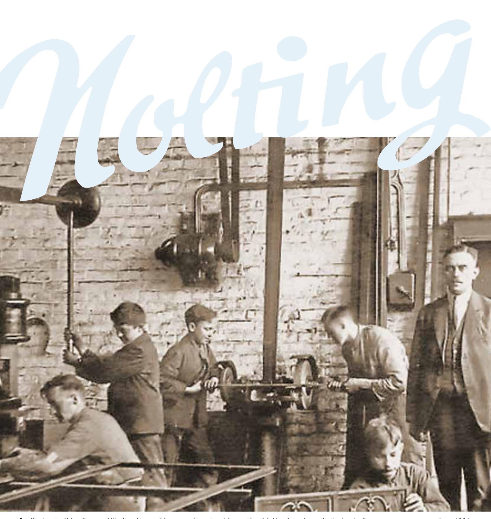
Quality is a tradition for us: skilled craftsmanship, commitment and innovative thinking have been the bedrock of our company success since 1921.